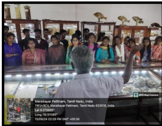
Briefing about museum collections