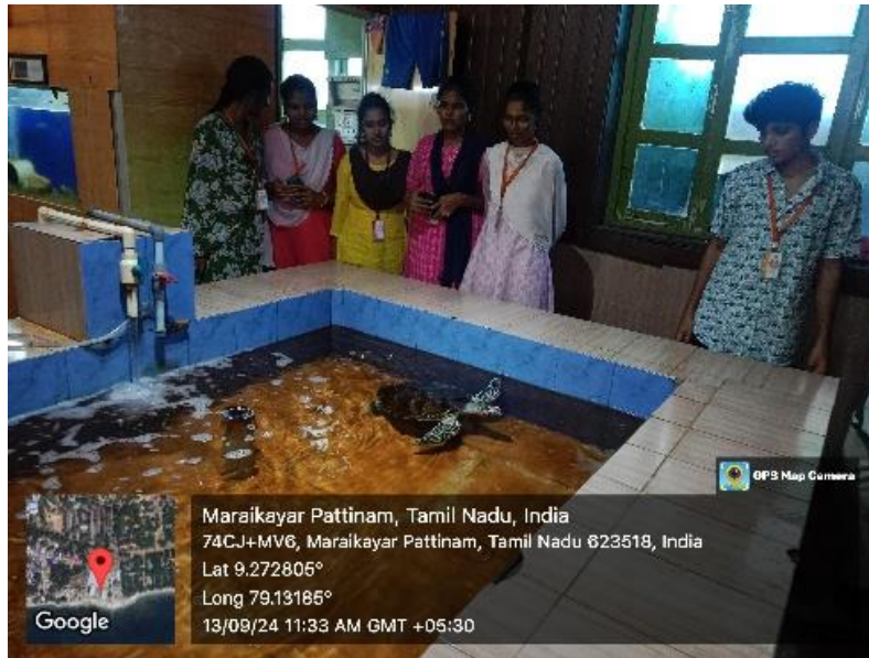
Visit to Fish Aquarium