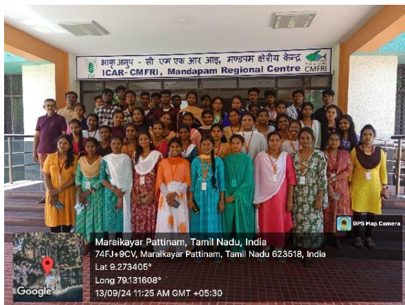
Figure 1: Group Photo at CMFRI