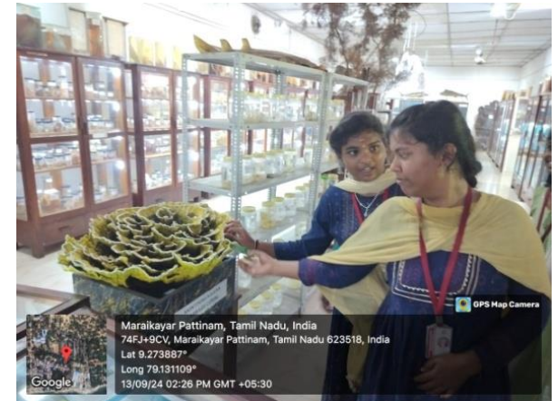
Marine algal Museum lab