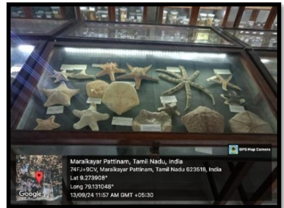
Star fish Specimen